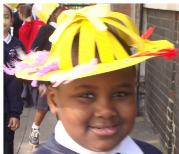
A picture from the archive

Start to get those bonnets ready. Our annual parade is on Wednesday 23rd March, 2016 at 9:00am