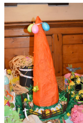
Highlights from the Easter Bonnet Parade