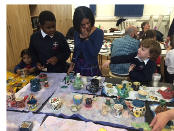
Family Pottery Tea Party