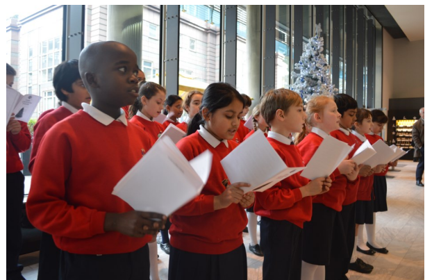
Our Christmas Stings Concert, followed by the senior Choir singing at a local business, raising money for our class charities