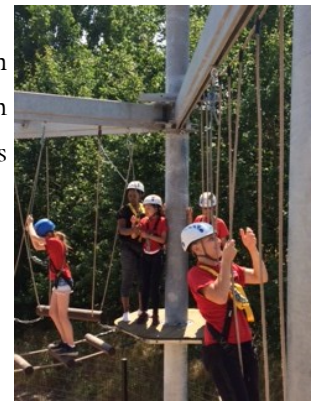
Year 6 on the high ropes

As the school year comes to an end, we at SJC would love to hear about what you are doing during the summer holidays. Send us a post card of places that you have visited. It could be visiting different places in the UK or overseas, long holidays or day trips, share you're experiences with us.